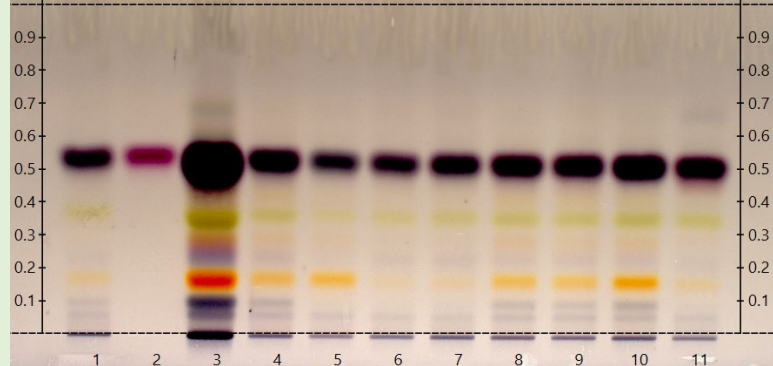
Plate Image 1: Derivatized with Vanillin/Sulfuric Acid Reagent, visible light